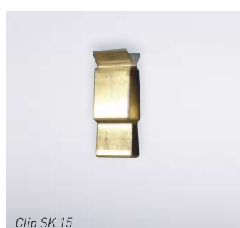
Clip SK 15